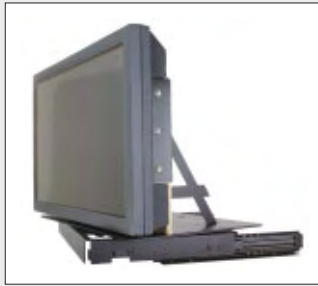
Shown with optional brackets for mounting flat panel TVs.

Packing: 1 pc. (complete with all mounting hardware and mounting instructions)