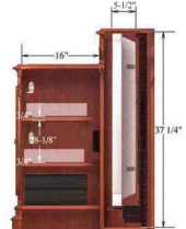
SIDE VIEW SECTION