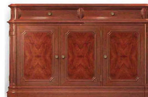
FRONT VIEW (CLOSED) (WITH WOOD PANEL)