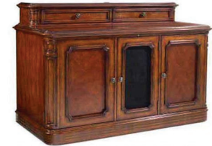
FRONT VIEW SHOWN WITH SPEAKER CLOTH CENTER PANEL