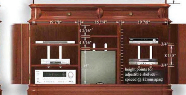
FRONT VIEW (OPEN)