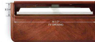
TOP VIEW (LID OPEN)