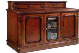
FRONT VIEW SHOWN WITH GLASS CENTER PANEL